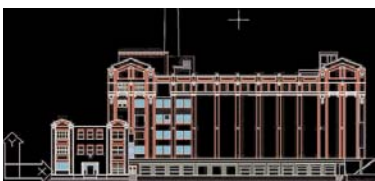
Accurate 2D Elevation from Point Clouds